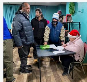
More people being registered