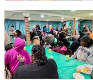
Waiting to be served