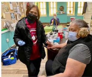
Lion Cora taking blood sugar